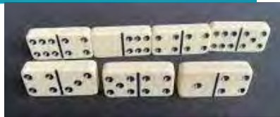
Dominoes / 42