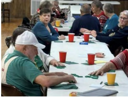
The day began at the KC Hall in Schulenburg at 9 with coffee, games and conversation.