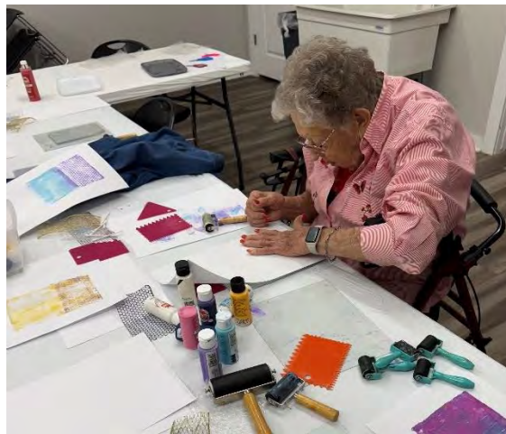
Two of our members created one-of-a-kind Geli printed papers to be used in collage.