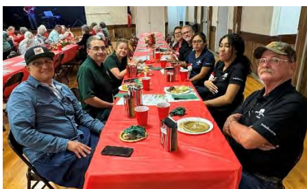
The meal was delicious, with Jordan Ranch providing the beef for everyone's plate! And they brought a team of volunteers!