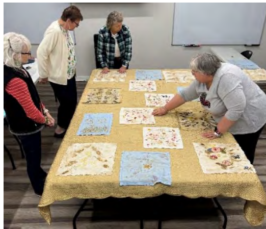
Our slow stitching project is almost complete. Each square was lovingly stitched by members and one day will become a unique quilt..